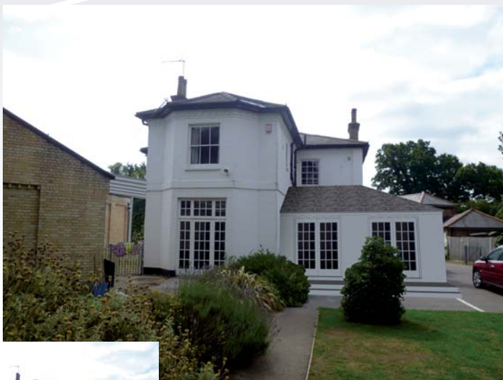
View of extended meeting rooms