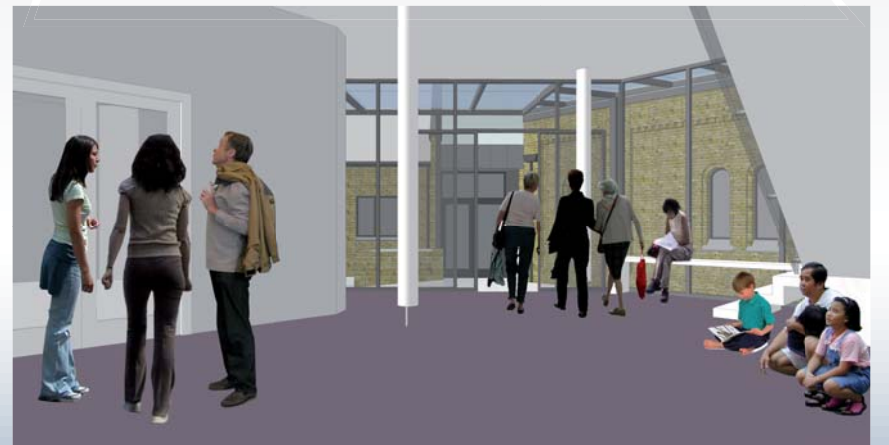
View from inside welcome area