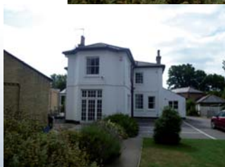
Existing rear view