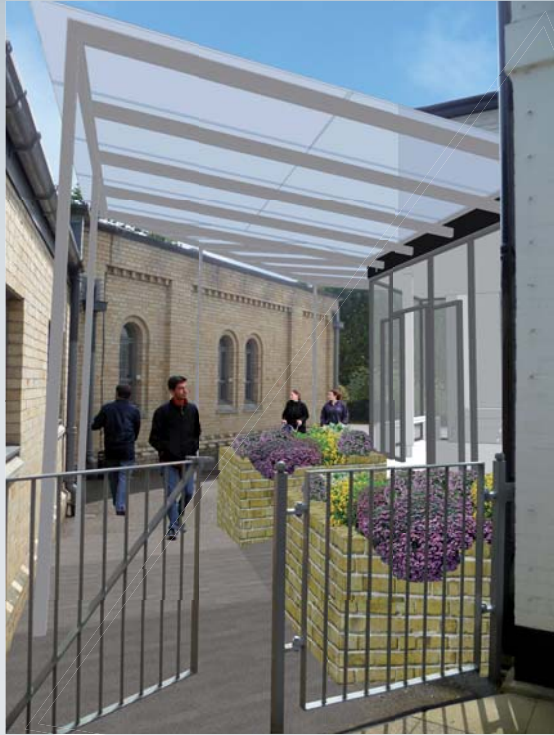
View from the side gate