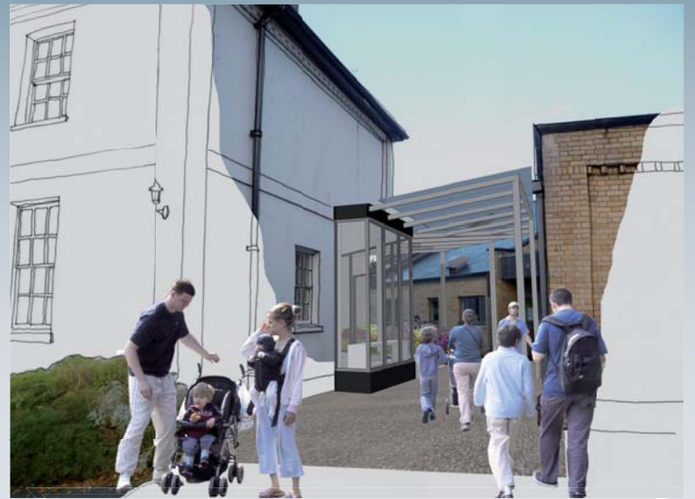
View of the entrance from the car park